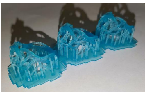
Fig.1 Initial color of printed parts.

The printed pieces should be rinsed with isopropyl alcohol (IPA) or immersed in ultrasonic bath filled with IPA for 30 sec, then manually washed with water followed by IPA. The washing cycles should be done until the parts will be free of liquid resin. Manual washing with soft paint brush could facilitate the cleaning process. After 3 cycles if the parts are still in resin it is desired to continue cleaning process in 5% detergent solution in order not to dissolve surface of printed part (negative defects could appear after investment casting). Afterwards, printed parts recommended to blow with compressed air and finally dried at 80oC for 30 minutes. Post curing in UV chambers under glycerol (in order to achieve better curing of printed parts surface) until the part will change color from blue to semitransparent (Fig.1, Fig.2).