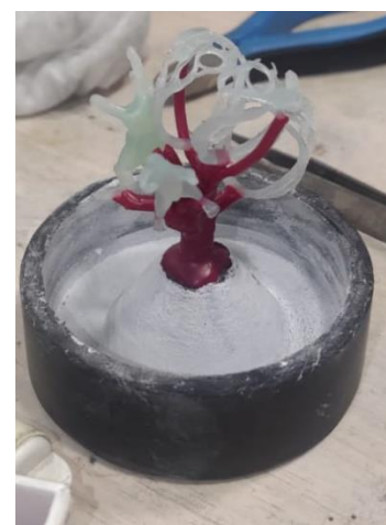
Fig.2 Post cured parts.

The information above is believed to be accurate and represents the best information currently available to us. All test specimens were printed, cleaned, and post-processed per instructions provided by HARZ Labs company. Results provided here are representative of these processes and may vary if these established protocols are not followed. Users should make their own investigations to determine the suitability of the information for their particular purposes. In no event shall HARZ Labs LLC (ООО «ХАРЦ Лабс») be liable for any claims, losses, or damages of any third party or for lost profits or any special, indirect, incidental, consequential or exemplary damages, however arising, even if HARZ Labs LLC (ООО «ХАРЦ Лабс») has been advised of the possibility of such damages.